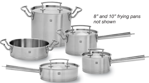
8" and 10" frying pans not shown

TWIN® Select 11-piece induction cookware set ($1,000 retail value)